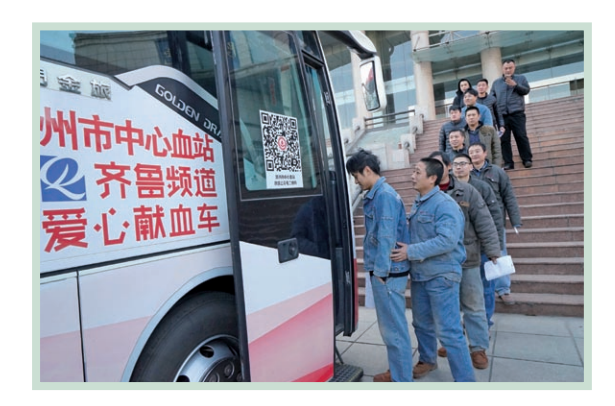
Staff participating in blood donation activity

The Group always pays close attention to the interests of the community where it operates and regards improving the community well-being as an important way to realize its value. Over the years, the Group has organized various types of public welfare activities and encouraged employees to participate in these activities such as tree planting activity, sanitary activities inside and outside the factory, blood donation and safety welfare activity, to contribute to the maintenance of a comfortable and clean community environment and helping others. During the Year, the Group planted more than 40,000 trees of various kinds in the communities where it carries out business operations, which not only embellished the environment but also enhanced staff's awareness of environmental protection.