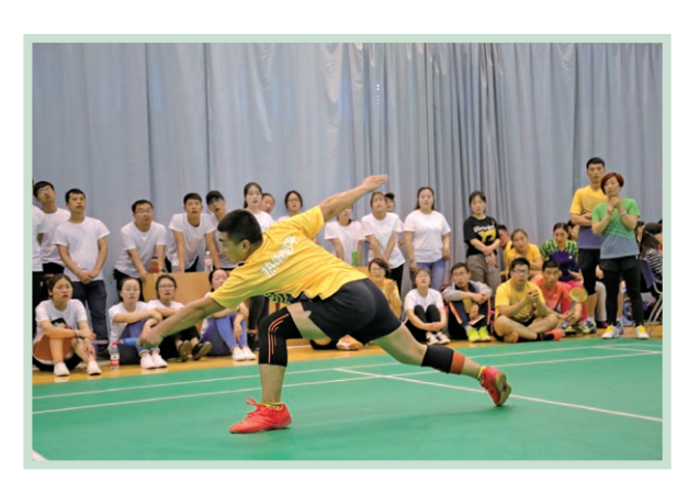
Employees' sports gala