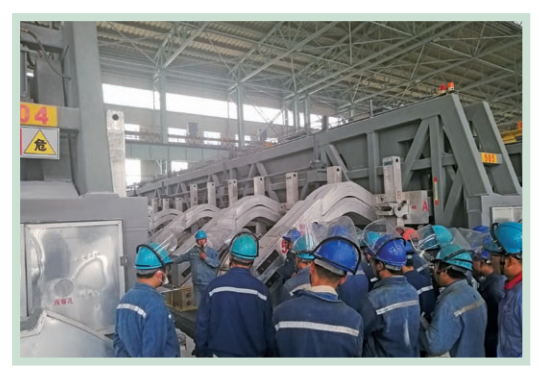
Special training on technical condition control of electrolysis cell