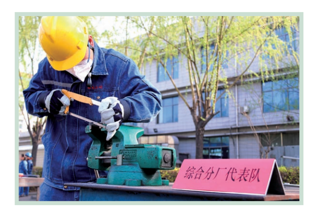
Technical competitions (production techniques)