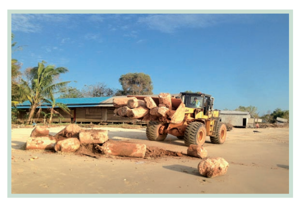
PT. Well Harvest Winning donating building materials to help the local's repairing of the damaged coastline