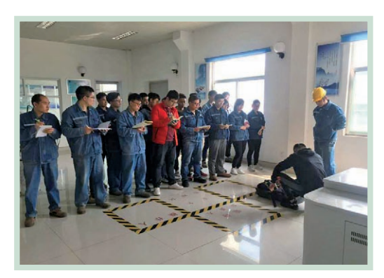
First aid training

With the launching of safety month activities, the Group provides its employees with various safety trainings such as training on first-aid knowledge, usage of special equipment (such as lifting machinery) and emergency treatment to increase their safety awareness and strengthen their abilities to handle emergencies. We also conduct regularly assessments to the safety knowledge of the management of our subsidiaries to ensure that they have the required safety risk management and processing capabilities.