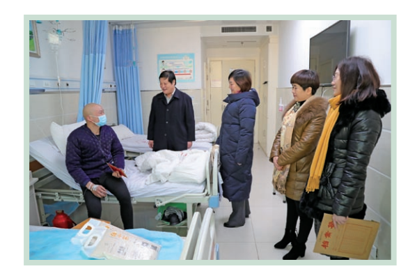
Visiting the sick employees

The Group has always adhered to the philosophy of "thinking from the employees' perspective, resolving their concerns", providing them with what they are in need and caring about their families and lives. The Group's labor union carries out regular surveys and visits to employees in difficulties, and takes the initiative to understand the living situation of employees in difficulties, their family relationships and financial burdens. Priority is given to employees who are suffering from illnesses, or whose families encounter misfortunes or difficulties in life. During the Year, the Group invested a total relief payment of RMB182,000 to provide assistance to 35 families in need, helping them step out of difficulties.