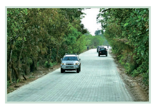
Boké Harmony Avenue built by SMB Winning Consortium with capital donated