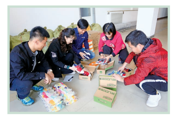
Staff sorting out the supplies for Tibet

In addition, the Group is also concerned about the living difficulties of needy children in Tibet. Through social platforms, our staff voluntarily organized the collection activities of used clothes, shoes and hats, lives, study and bedding, and purchased sports shoes, school bags and others at their own expense, and sent such supplies to more than 40 villagers in Tibet before the Children's Day as holiday gifts for children.