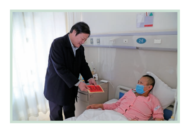
Providing financial assistance to the sick employees