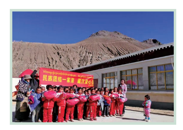
Delivering donated living and school supplies to needy children in Tibet