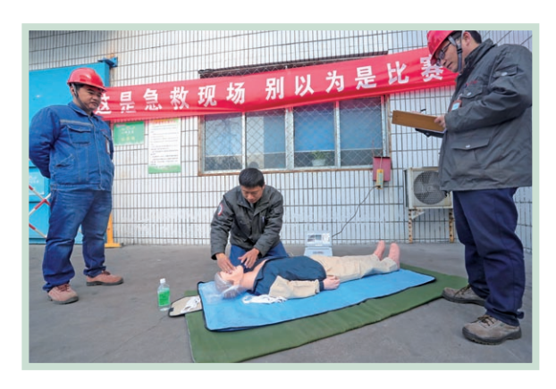
Technical competitions (occupational health and safety