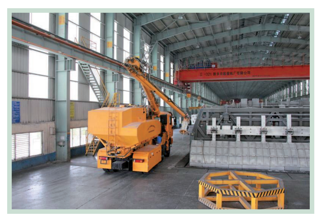
The newly introduced automatic material filling truck