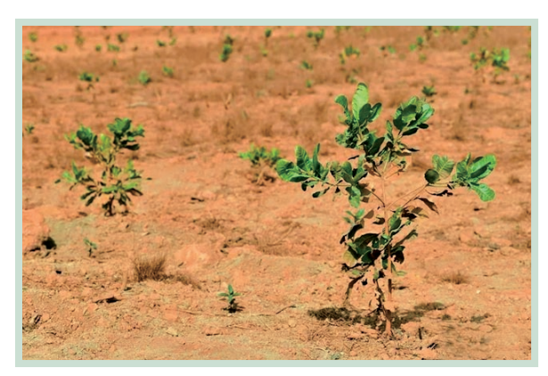
Mined land restored by SMB Winning Consortium

As of December 2018, SMB Winning Consortium has directly hired more than 5,000 labors in Guinea, and the number of the subcontractors and merchants who specially served SMB Winning Consortium reached over 3,000, and more than 50,000 job opportunities (including indirect employment) have been cumulatively created in Guinea. During the Year, tax paid by SMB Winning Consortium to Guinea amounted to USD200 million. Its projects have been running smoothly in Guinea which attracted more enterprises and investors to invest in the mining, infrastructure construction and agriculture industries, hence driving the economic growth of Guinea.