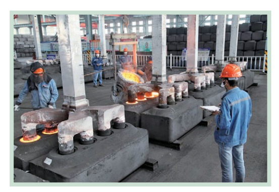
Anode casting technique training