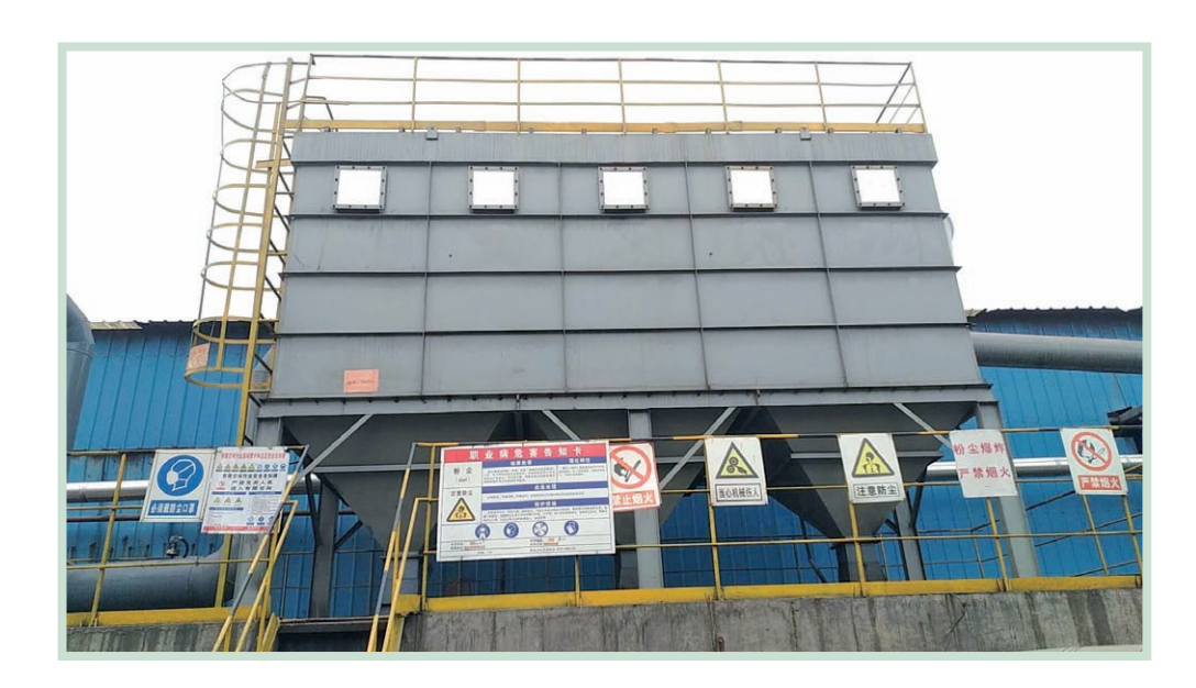
Modified explosion-proof dust collector

Due to the flammable and explosive properties of coal dust, the Group improved the dust removal effect of the dust collector by modifying the explosion-proof dust collector system and model to reduce safety risks. The modified dust collector can effectively remove 99.8% of dust and maintain the dust emission concentration below 20mg/Nm³, which greatly reduces the chance of dust concentration exceeding the standard and thus ensures production safety.