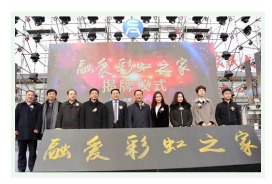
Open Ceremony of Rainbow Home of Love