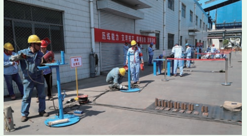
Technical competition sites