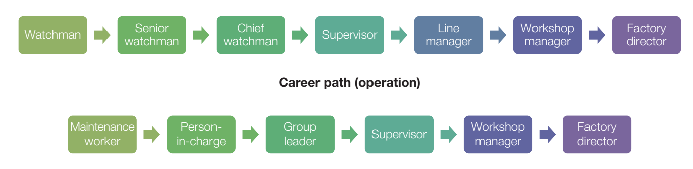
Career path (maintenance)