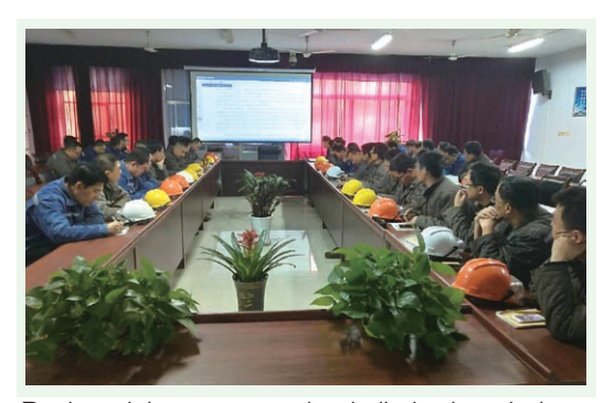
Basic training on operation in limited workplace

With the launching of safety month activities, employees are provided with trainings on safety to continuously increase their safety awareness and strengthen their abilities to handle emergencies. In order to enhance the safety production capability of employees, the Group continues to optimize its production systems and introduces automation technology to upgrade production facilities. During the Year, the Group conducted a number of transformation projects such as replacement of manual operation of cut-off valve of the gas station in alumina plant with pneumatic operation, replacement of manual lifting and cleaning of electrolytic aluminum plant with full mechanical cleaning, which not only reduced labor intensity but also improved the working environment and reduced safety risks.