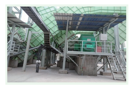
Optimized purifying draught fans

Dissolution of aluminum at high voltage is substituted by dissolution by pipelining and thermal insulation pipe in the dissolution workshop. The operation efficiency has been enhanced significantly, which minimizes steam consumption and labor force, reducing the numbers of workers from 64 to 35 and approximately 720,000 tons of steam are saved per year.