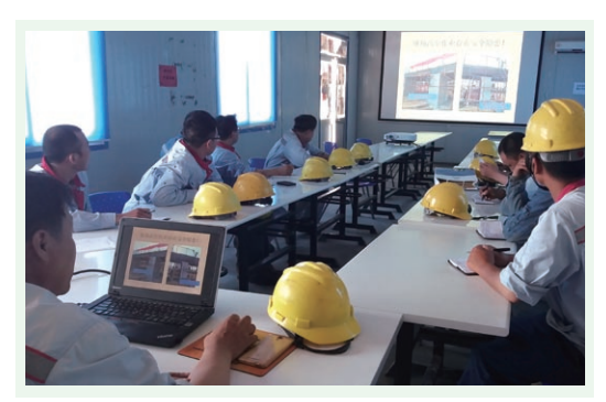
Supervision training for overhaul technicians