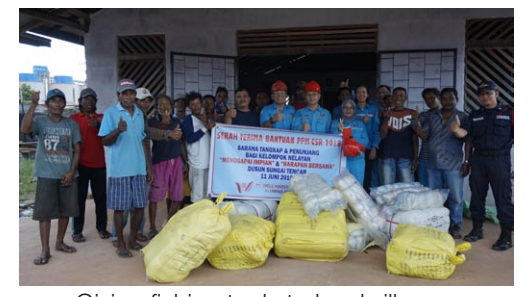
Giving fishing tools to local villagers