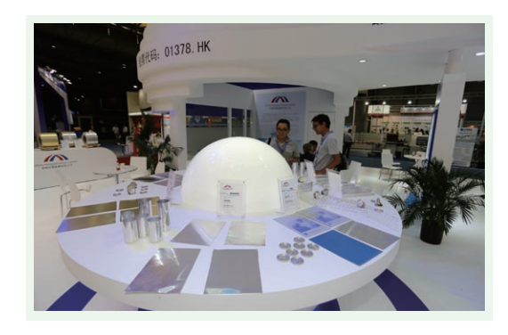
Participating in exhibitions